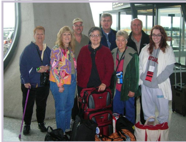
Here is a picture of the group at the start of their journey to Mthatha